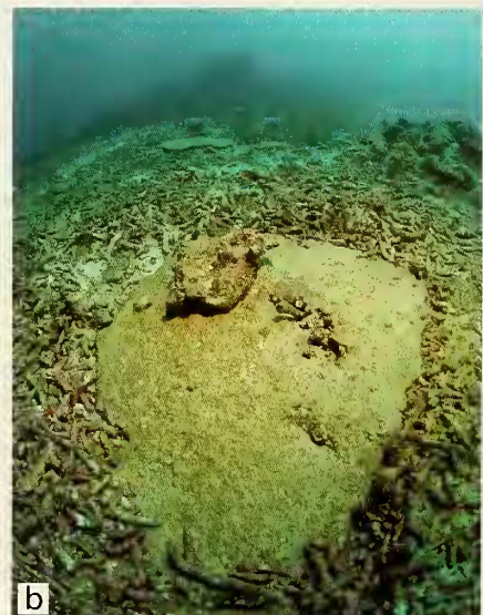
Figure 16. (a) Overturned dead Acropora spp. tables at 10 m water depth at Pulau Rondo, October 29, 2005. (b) overturned dead table coral surrounded by branching coral rubble.